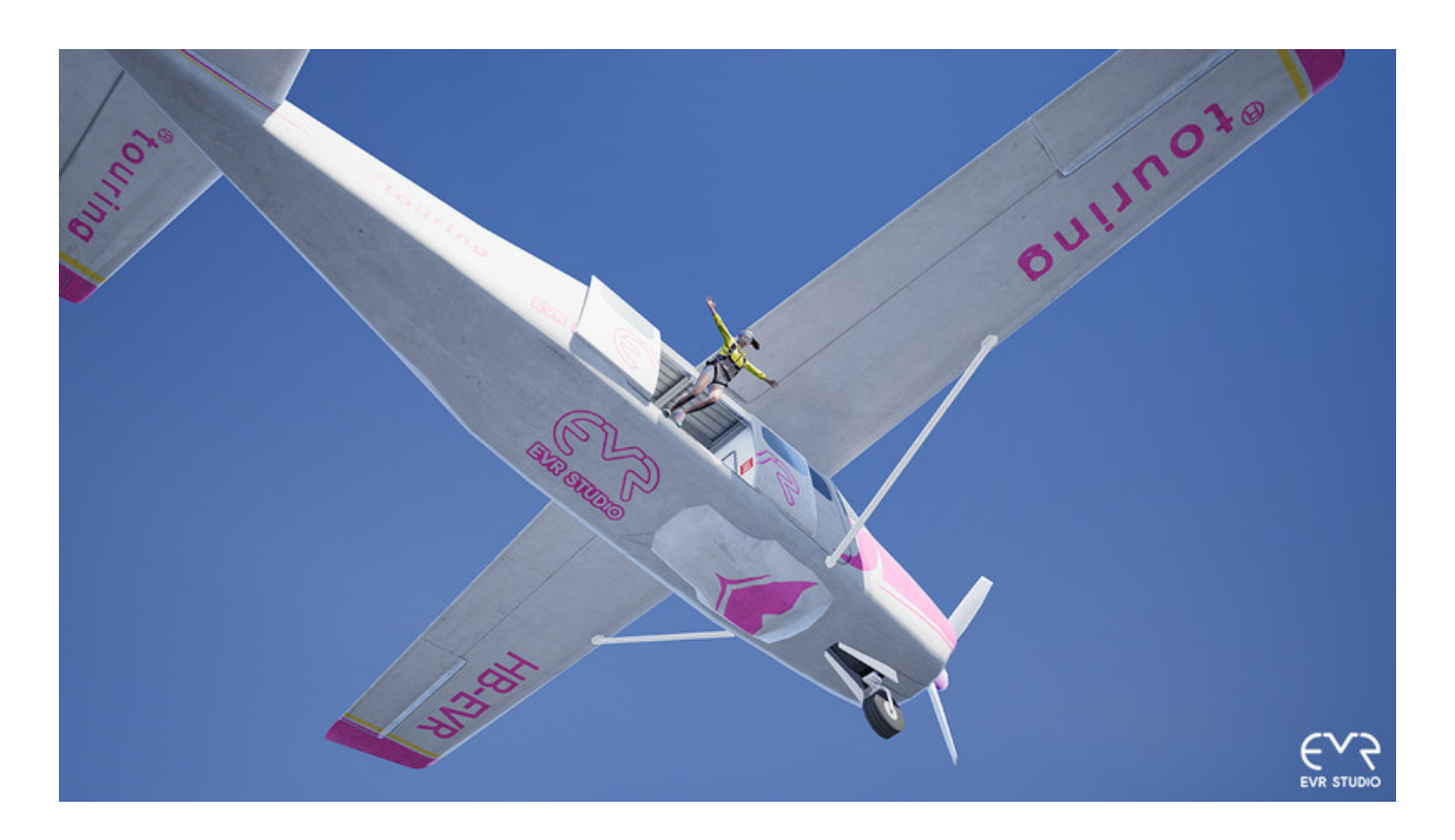
ProjectM: Daydream Activation Code [Crack Serial Key

Download ->>->> <a href="http://bit.lv/2SMDpYF">http://bit.lv/2SMDpYF</a>